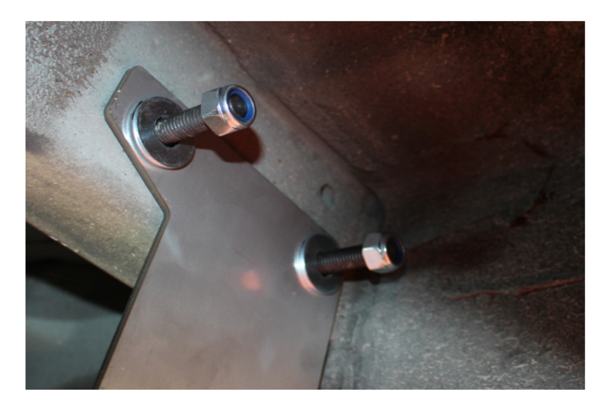
Place the step on the brackets and tighten the nuts bij hand

Place the mounting backets left and right on the bolds and mount the washers and nuts on it NOTE , DO NOT TIGHTEN YET